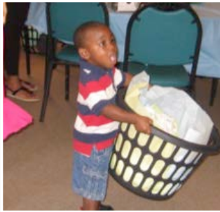
A helping hand from our Junior League Baby Shower helper!